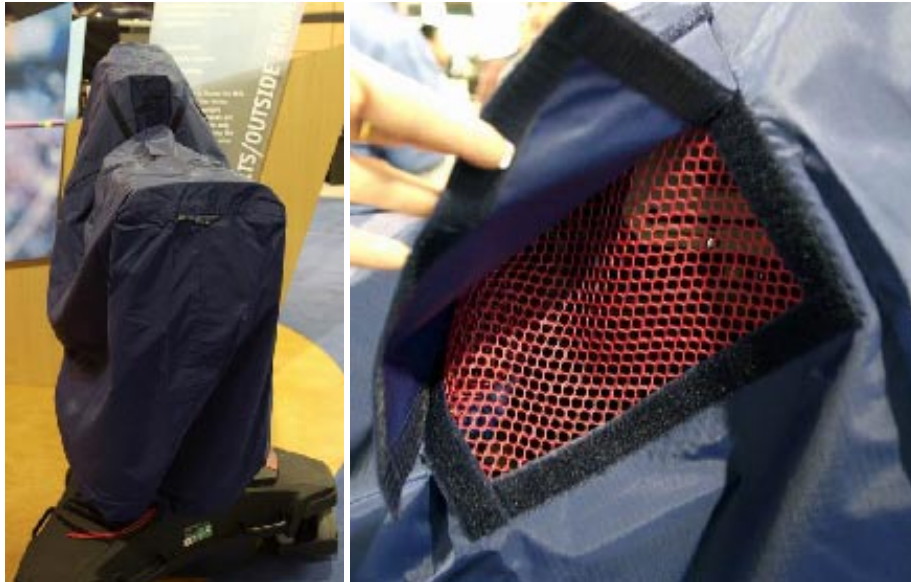
Elephant come with either Velcro or Zipper front and vents for humidity control

Elephant or overnight bags are big and roomy and have as few seams as possible. They also include venting windows for humidity control and a zipper in the front for easy on and off. The storage bag is attached at the bottom so you can't lose it.